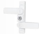
Mechanical: Door and window lock

BURG Lüling GmbH & Co. KG Volmarsteiner Str. 52 • 58089 Hagen (Germany) info@burg.de • +49 (0) 2335. 63 08-0